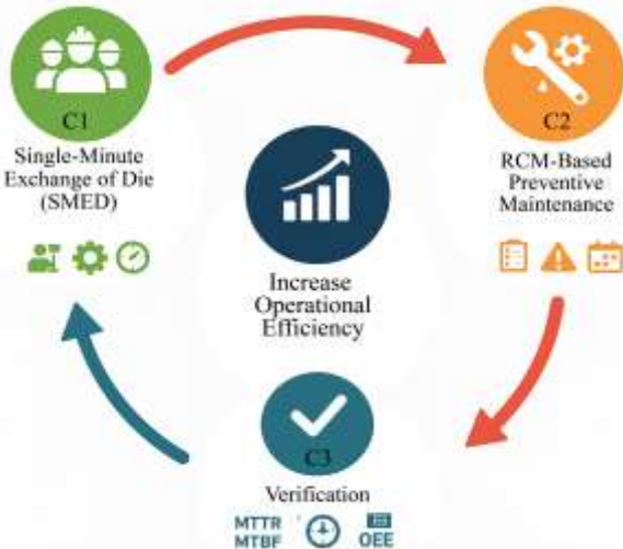
Fig. 1 Proposed model

improvement and getting rid of waste. The second part was making a preventive maintenance plan based on RCM. This helped find critical functions, failure modes, and root causes so that preventive actions could be set up that were in line with how important the equipment was. Lastly, the third part was a verification process meant to make sure that the improvements made were permanent. This all-encompassing strategy made it possible to align technical and human resources with an operational philosophy centered on dependability. This helped ensure that the improvements made would last in a competitive setting.