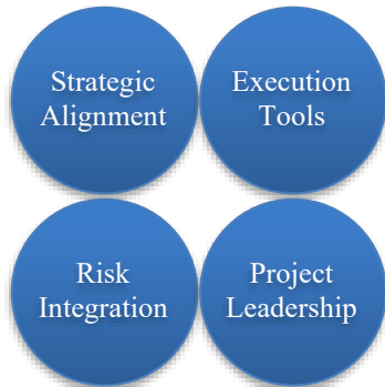
Fig. 1 Core Pillars of PMES Framework

(PMES) in the UAE construction sector (Figure 1), integrating both theoretical models and empirical insights.